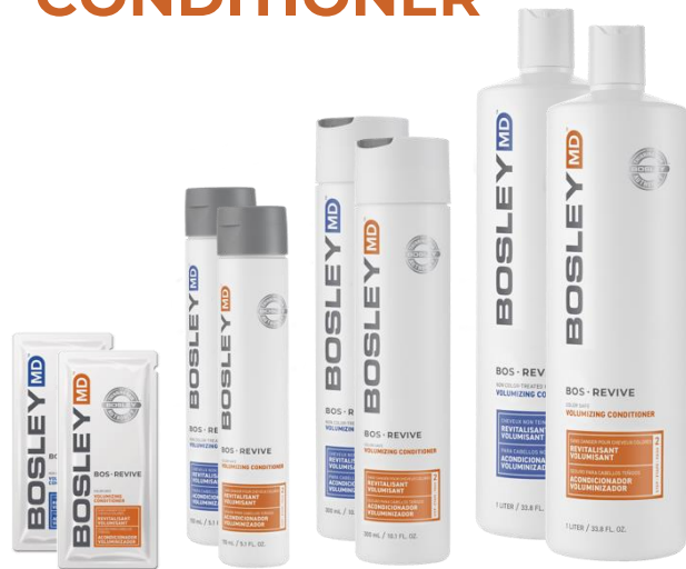
Sample (as part of duo)