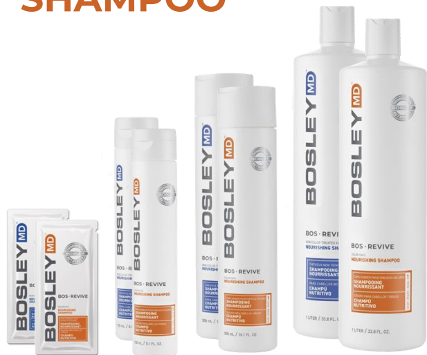
Sample (as part of duo)