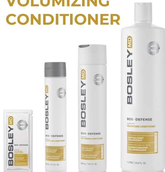
Sample (as part of duo)